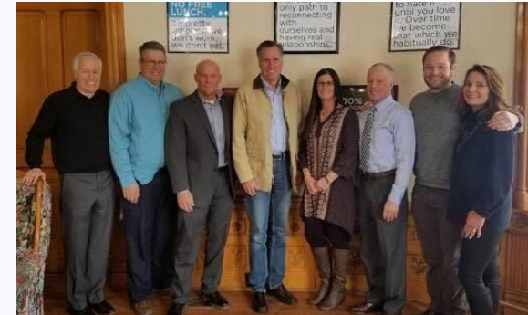
Visits from United States Senator Mitt Romney