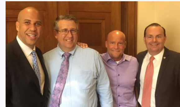
Visits from United States Senators Cory Booker and Mike Lee